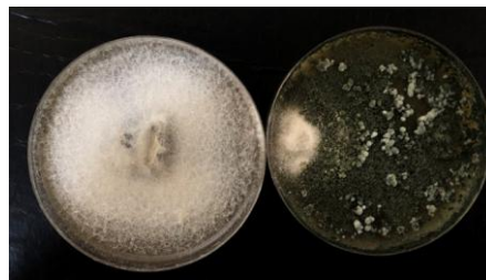
Figure 2. Antagonistic activity of the biotic fungus T. harzianum against the pathogenic fungus P. nicotianae .

varying according to bacterial concentration. The fifth dilution ( 8 \times 10^8 CFU/ml) exhibited a high inhibition rate of 94.44%, with a radial growth of 0.5 cm, compared to the control, where fungal growth reached 9.0 cm with 0% inhibition. This inhibitory effect is attributed to multiple mechanisms, including the production of antifungal compounds such as fatty peptides, enzymes that degrade fungal cell walls, and antibiotics that directly kill the pathogen (Al-Anzi, 2024). Similarly, T. harzianum significantly reduced the growth of P. nicotianae , achieving 91.11% inhibition with a radial growth of 0.8 cm, compared to the control with 9.0 cm growth and 0% inhibition. This effect is attributed to the fungus's multiple well-known mechanisms of pathogen control, including competition for nutrients and space, and the production of biocins and hydrolytic enzymes such as protease, \beta -1,3-glucanase, and chitinase (Hadar et al., 1978). These findings are consistent with previous studies demonstrating the biocontrol potential of T. harzianum against pathogenic fungi (Jaber et al., 2002; Hassoun, 2005; Matloub, 2007) (Figure 2)